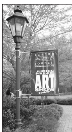
our new banner