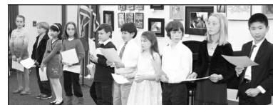
2011 youth participants