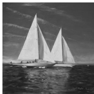
Cloud Study at Night's Edge